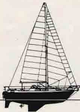
NC S 300