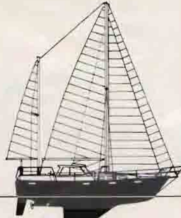
NC S 380