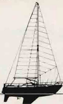
NC S 320