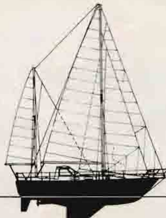
NC S 340