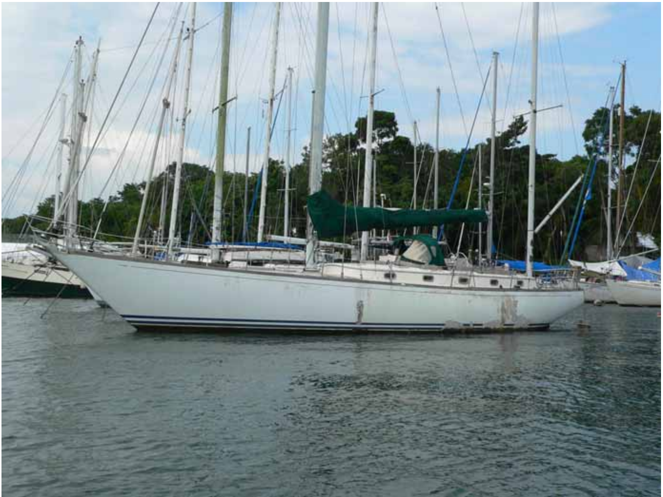
The sailing plan is original ketch