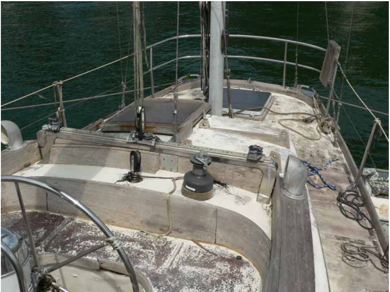
Boom winch behind the wheel