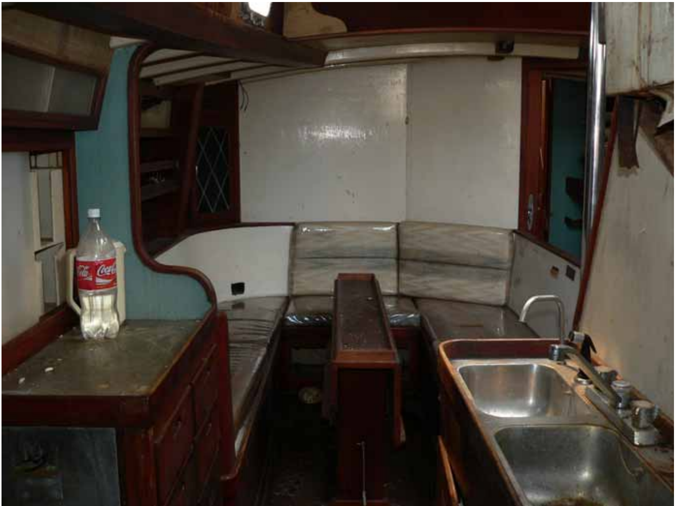
View from galley to salon