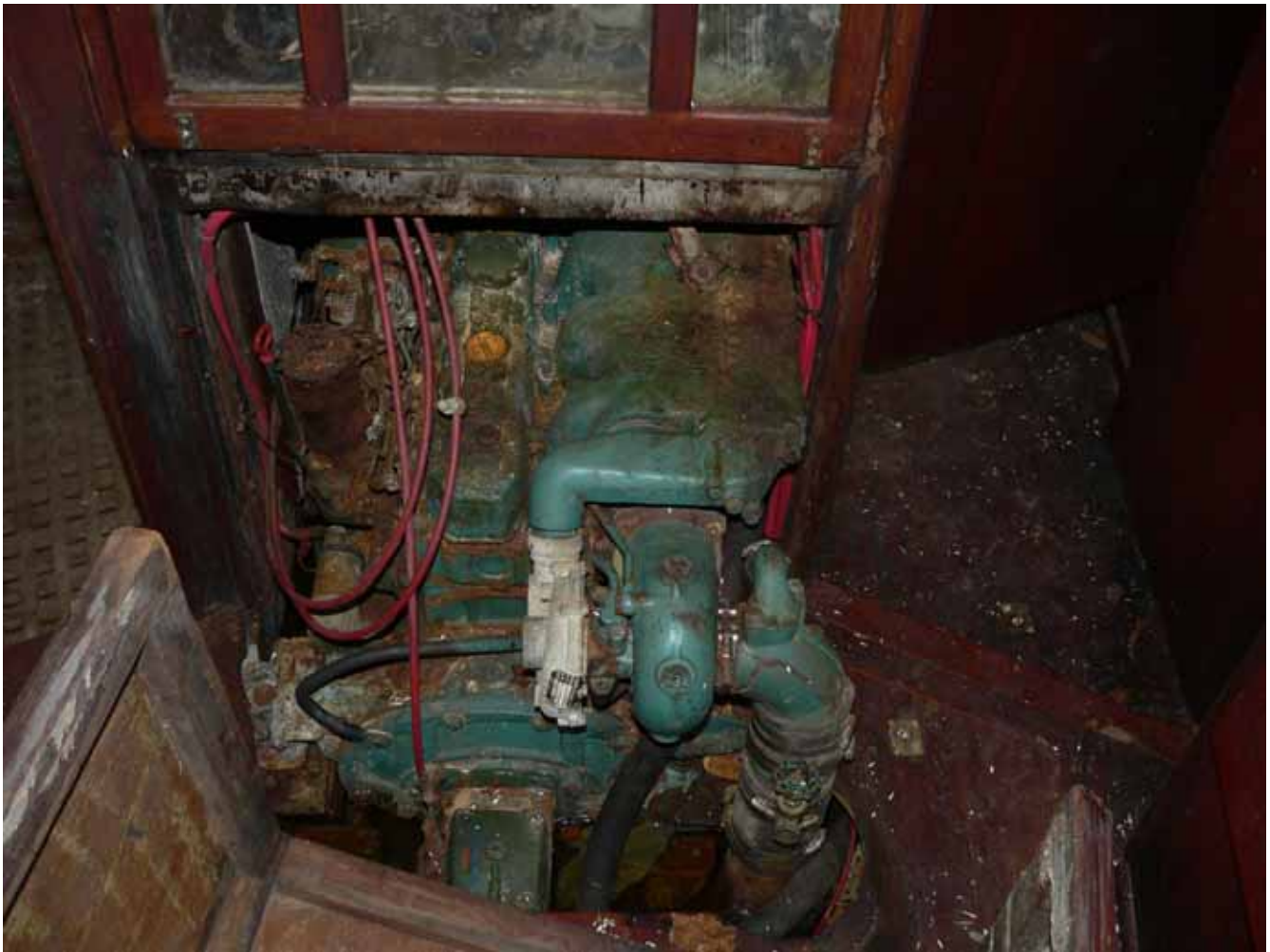
Volvo Engine could be rebuild but we think is much better to change it for a new one.