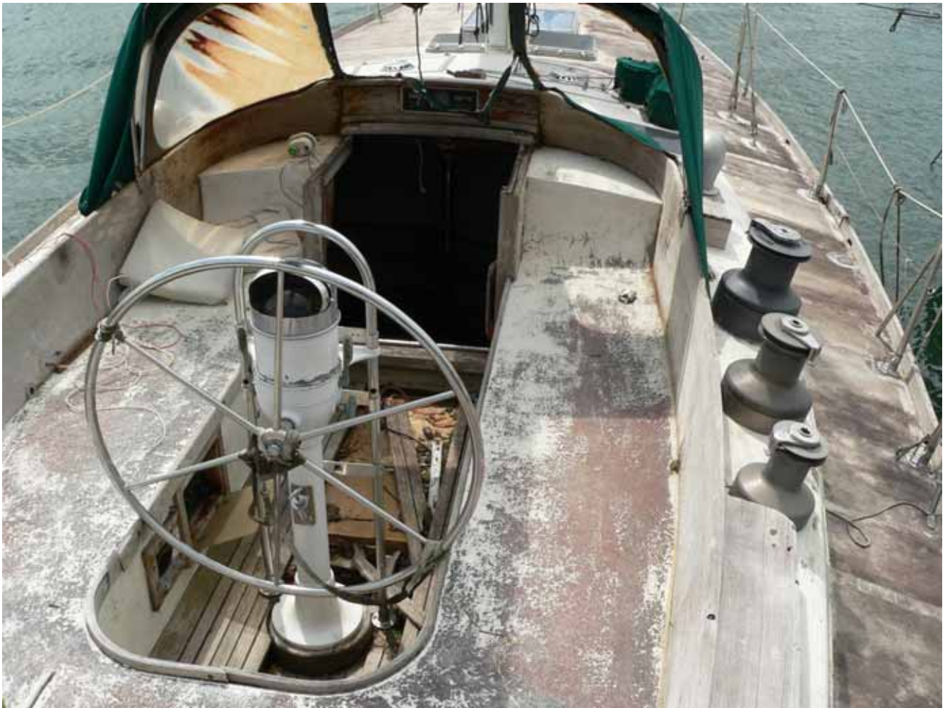
Cockpit and winches