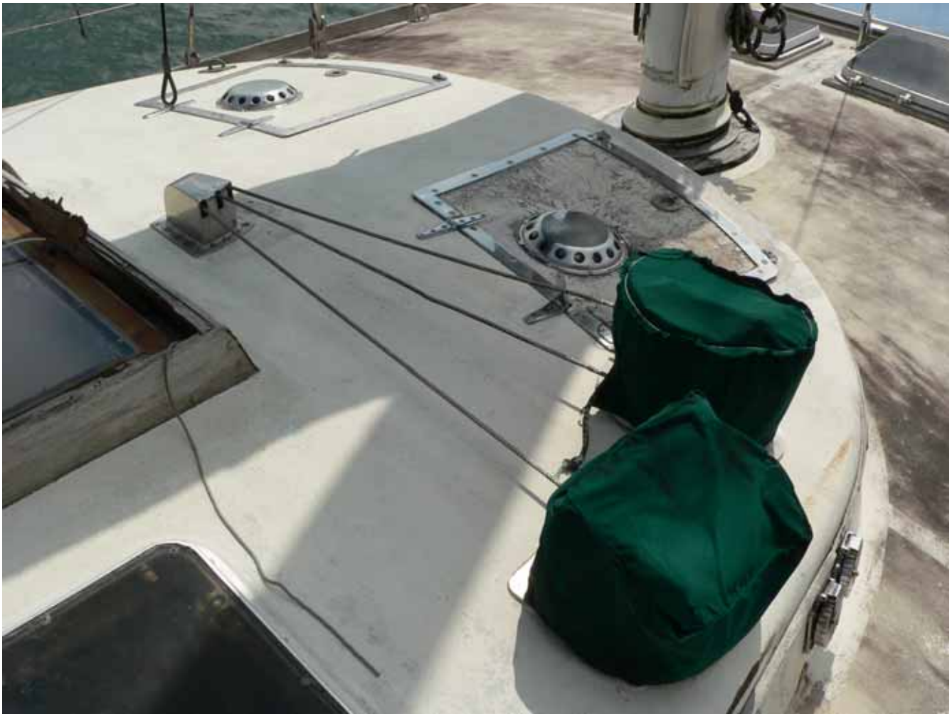
Cable winches to move the keel up/down and forward/aft